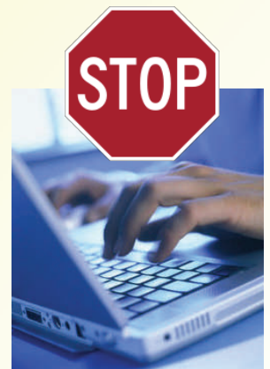
the end of keyboard input!

The form templates are created and modified by you, according to your needs.